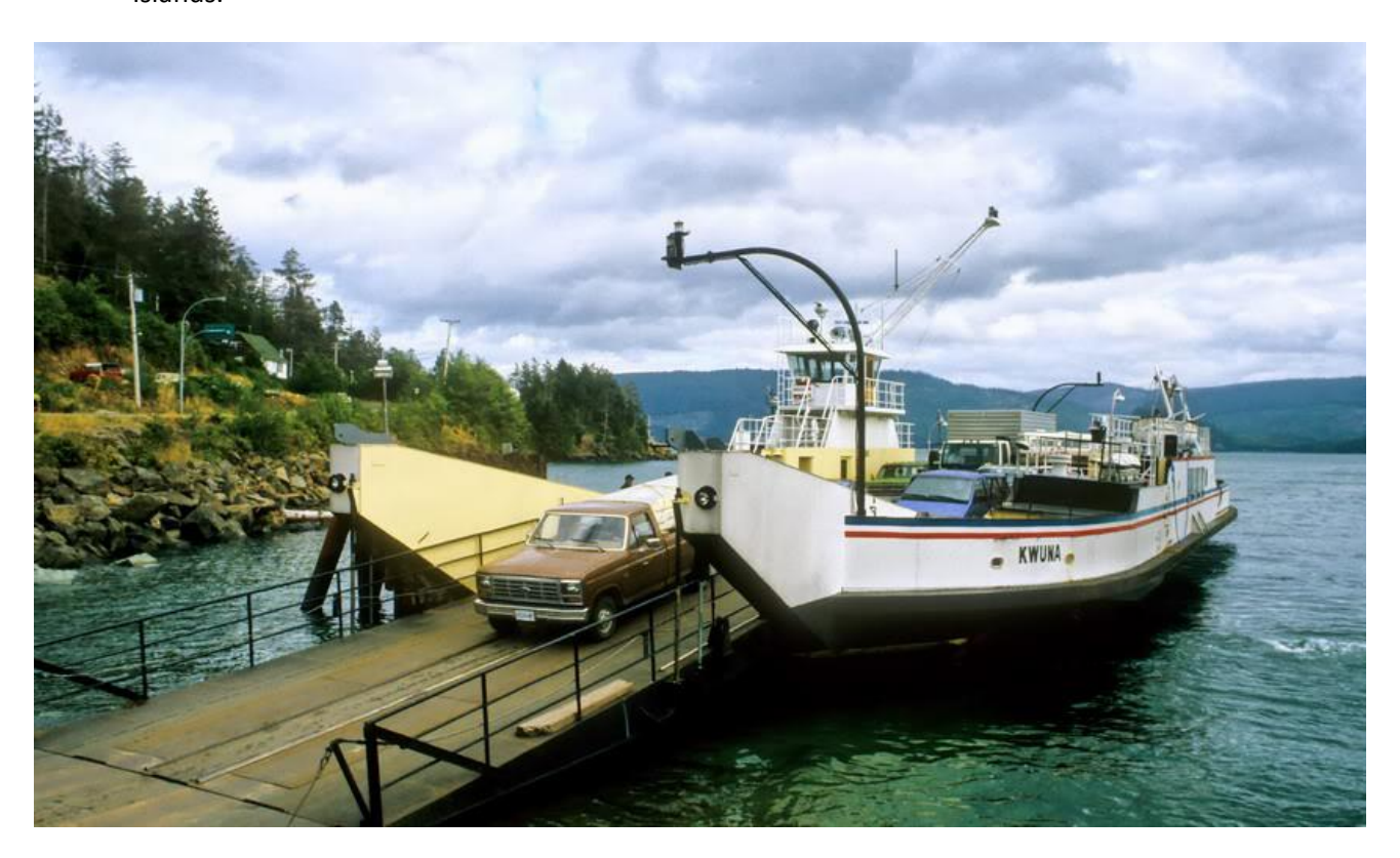
Example of a K class vessel using a 'landing craft' ramp configuration