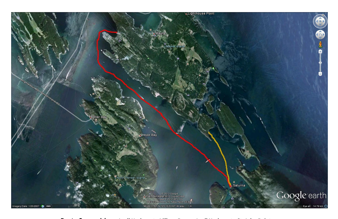
Route Comparision – Lyall Harbour to Village Bay vs. Lyall Harbour to St. John Point

In the last year approximately 14,500 vehicles travelled to and from Saturna Island. With the ease of access to Saturna and Mayne Islands via this link we anticipate that traffic to at least double or potentially triple. This would create inter Island commerce, social and cultural exchanges and improve the economics of both Islands as a result. Emergency services (Police/Fire/Ambulance) for both islands would be additionally enhanced with the short link.